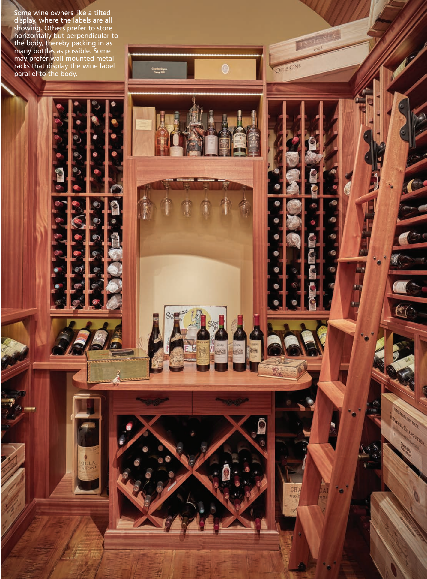
Some wine owners like a tilted display, where the labels are all showing. Others prefer to store horizontally but perpendicular to the body, thereby packing in as many bottles as possible. Some may prefer wall-mounted metal racks that display the wine label parallel to the body.