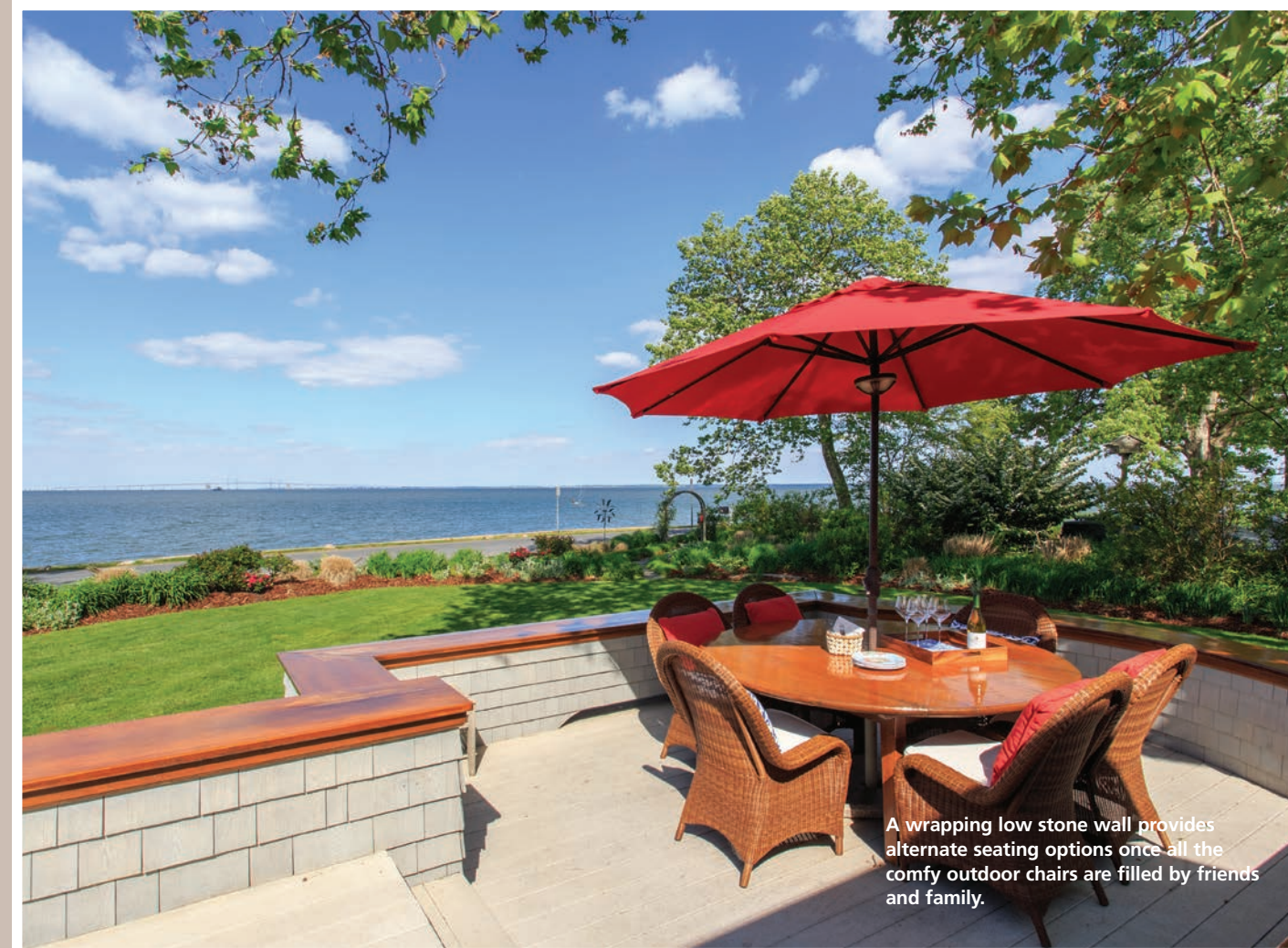
A wrapping low stone wall provides alternate seating options once all the comfy outdoor chairs are filled by friends and family.

systems allow the doubling of an entertainment area with easy flow across the width of the large opening. These walls can fold on themselves in a scissor-like fashion or they can slide and stack into a wall pocket. For broad stroke planning, they are approximately $1000 per linear foot. They have different threshold conditions so be cognizant that if you desire a totally flush floor system, this dictates a certain product. These systems are more often found in areas of year-round warm weather. And when bugs prevail, a large screen is married with the folding glass panels. These screens can be accordion sheets or one large blanket with a split for walking through. These large door units are perfect for the walls between a great room and a screened porch.