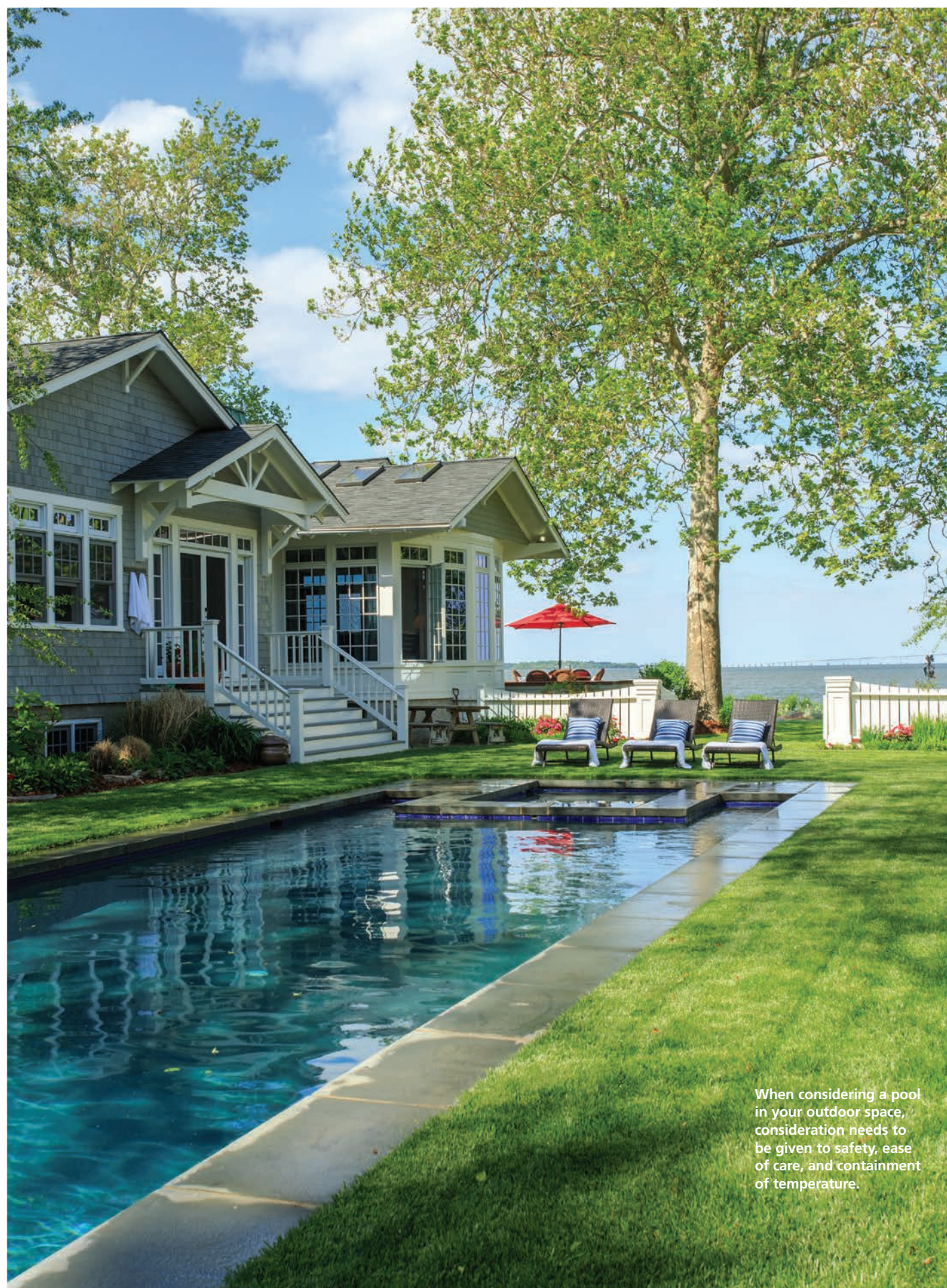
When considering a pool in your outdoor space, consideration needs to be given to safety, ease of care, and containment of temperature.