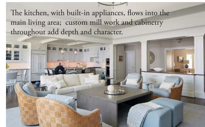
The kitchen, with built-in appliances, flows into the main living area; custom mill work and cabinetry throughout add depth and character.