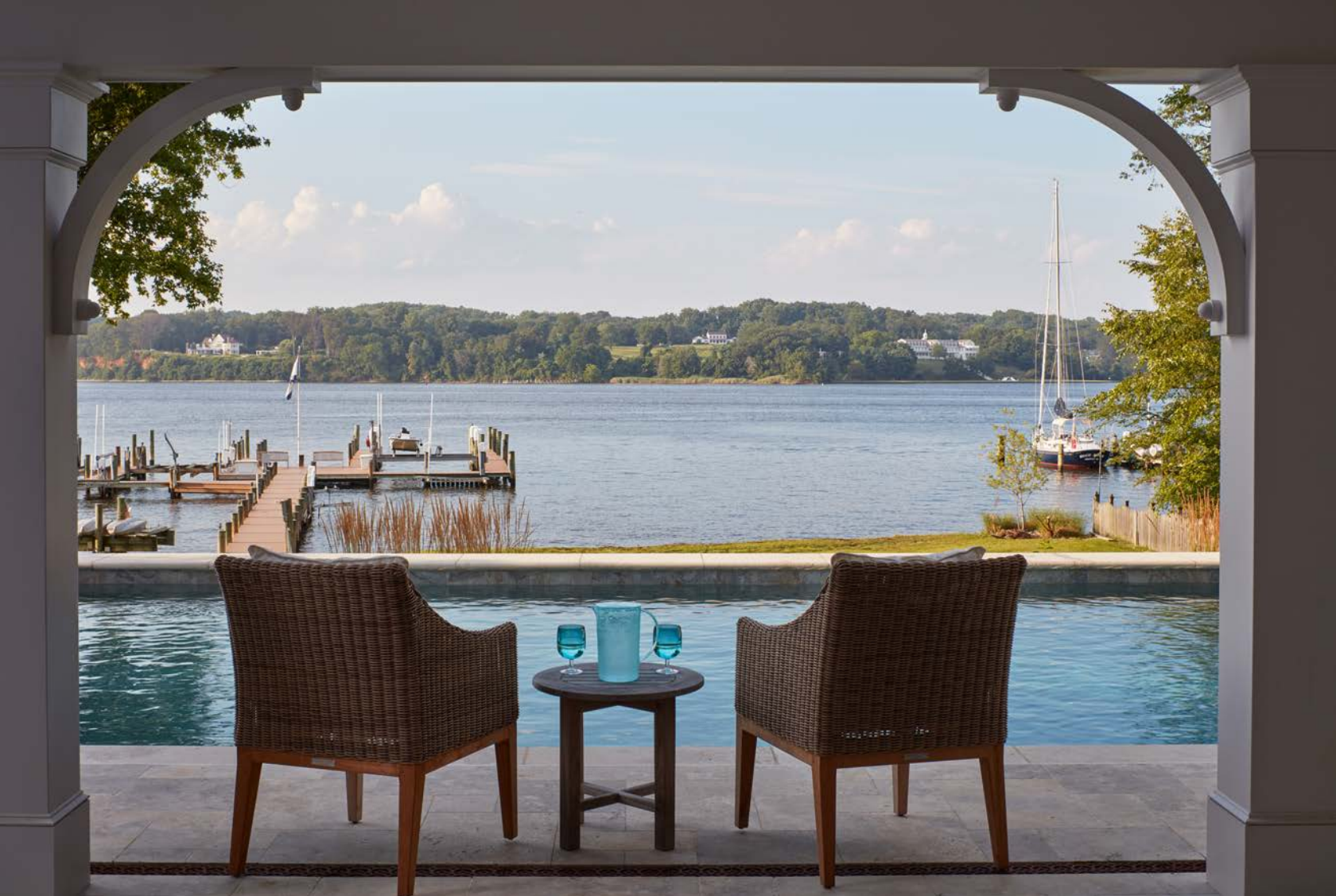
The pool is the only structure original to the property; it has been updated by Campion Hruby Landscape Architects with stone pavings and meadow-inspired native grasses.

At the back of the house, one has more opportunities to gaze lazily over the waterfront. The pool deck is an obvious choice. So too are the lounge chairs and seating around the fire pit—all comfortably ensconced in the terraced landscaped hillside that eventually leads to the water’s edge. Each option affords unobstructed views of the river and the wildlife and people who play in and around it.