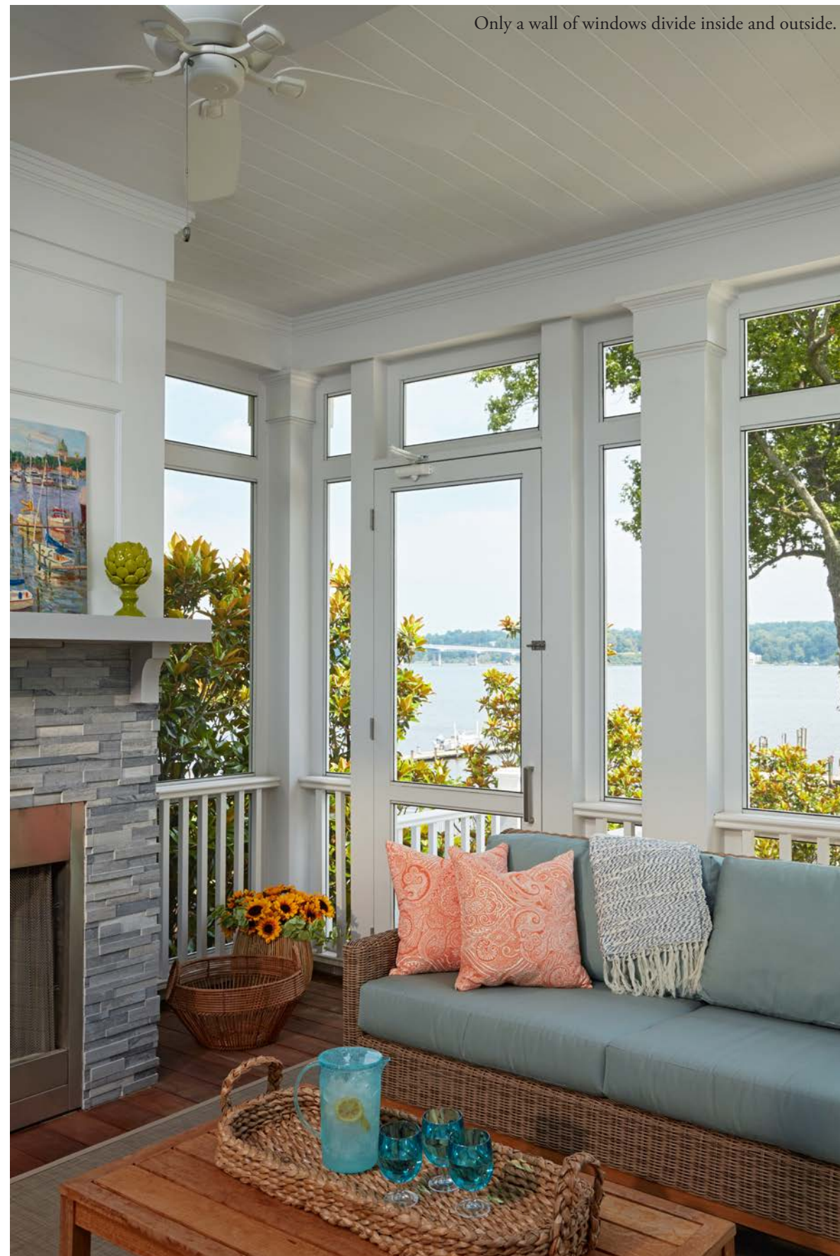
Only a wall of windows divide inside and outside.